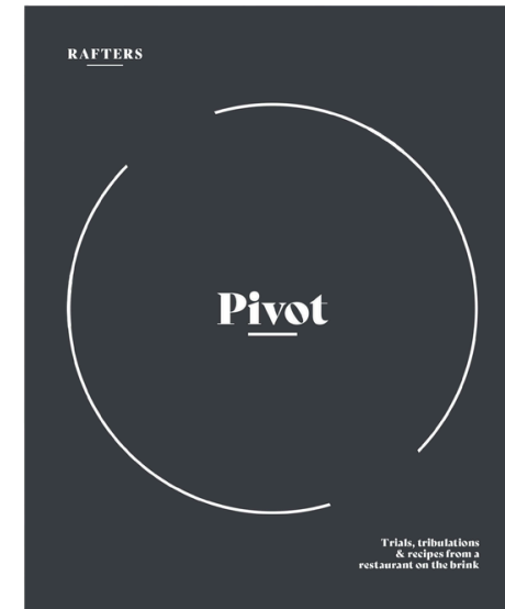
RAFTERS DEBUT COOKBOOK "PIVOT" by Tom Lawson & Alistair Myers 50+ dishes, 200+ recipes, 15 cocktails 40 pounds each